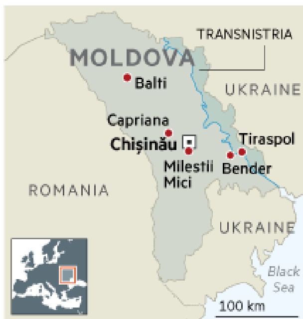
Figure 3: Moldova and Transnistria

The Pridnestrovian Moldavian Republic (PMR), commonly referred to as Transnistria, is a breakaway republic wedged between the Republic of Moldova and Ukraine (see Figure 3). This sliver of land follows the course of the Nistru River, and covers 4,000 sq km. Its population – more than half a million people – speaks Russian, Moldovan, and Ukrainian. Transnistria has its own capital – Tiraspol – its own currency – the Transnistrian rouble–, its own Parliament and Constitution, as well as its own flag and anthem. The Moldovan authorities do not have administrative control over the railway crossing points between Transnistria and Ukraine, such as the one between Pervomaisc and Kuchurhan (see Figure 4). 29 A railway connection links Ungheni (passing through Chişinău) to Tiraspol and then to Odessa (in Ukraine). Railway traffic between Chişinău and Tiraspol is occasionally closed because of political tensions between Moldova and Transnistria. 30