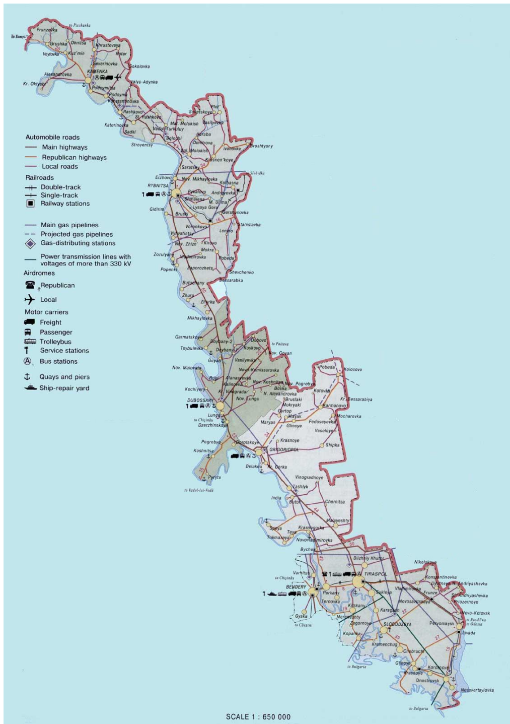
Figure 4: Transportation routes in Transnistria.

The conflict between the Republic of Moldova and Transnistria began in 1990, when Tiraspol declared its independence from Chişinău, fearing a scenario in which Moldova and Romania reunited. During the Soviet era, Transnistria was the most economically developed part of Moldova, concentrating almost 90% of electricity production and one third of the Moldovan heavy industry. 31 This industrial base provided Tiraspol not only with a source of income